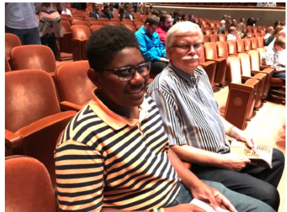
Ready for the orchestra production