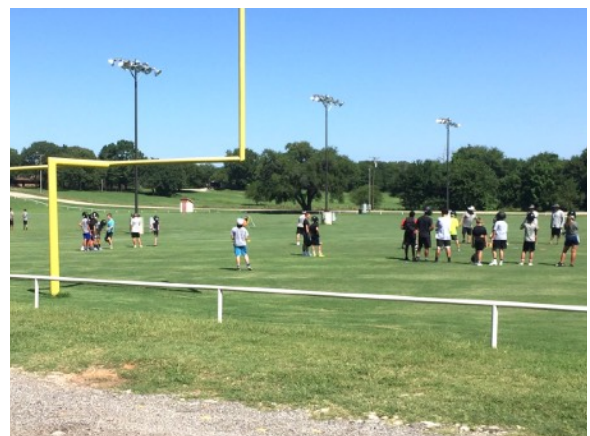
First football practice