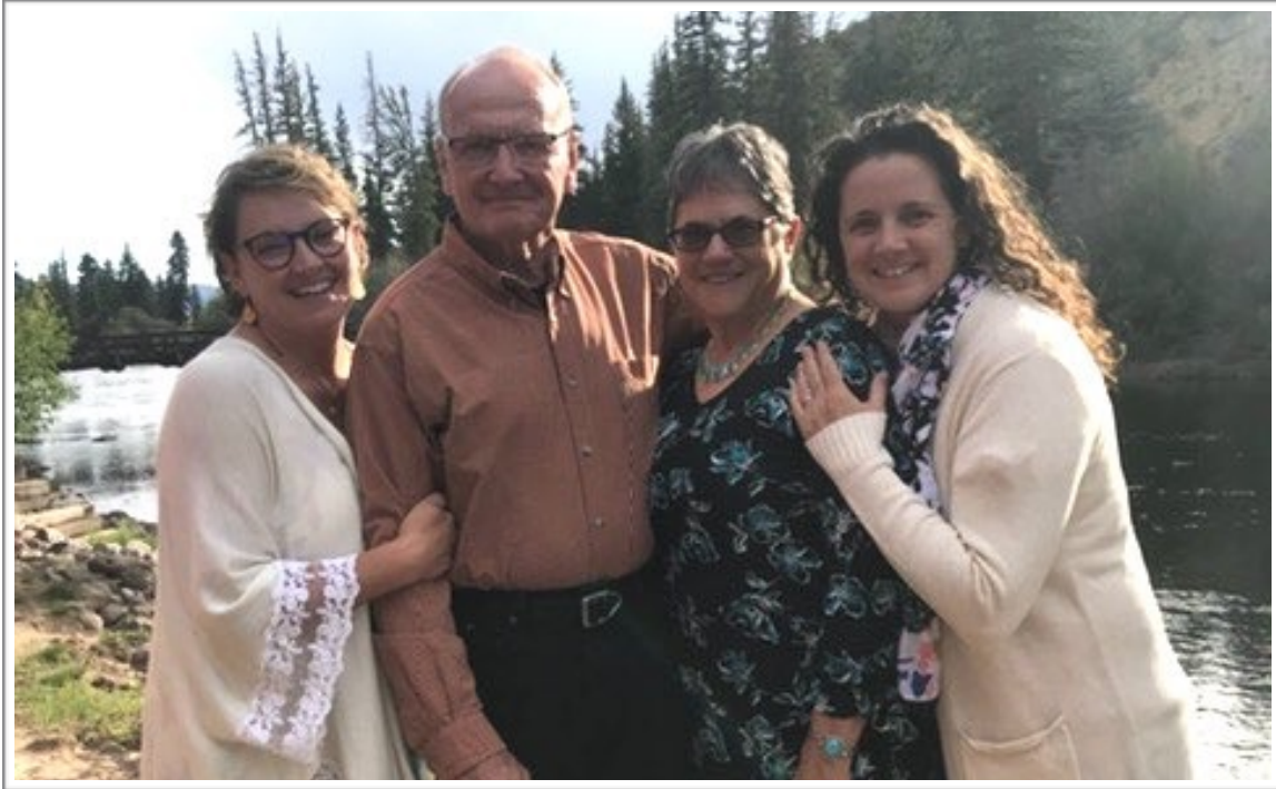
Happy 50th Anniversary to Mama and Papa!!