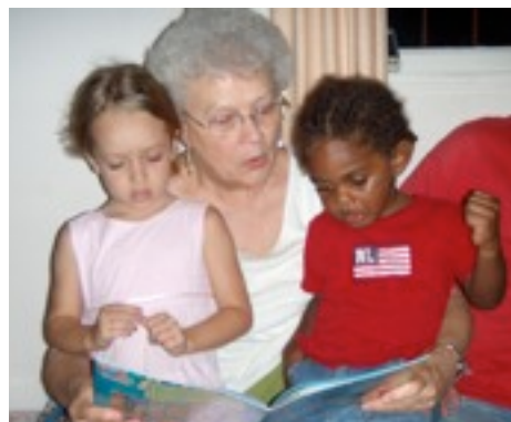
Reading with Grandma