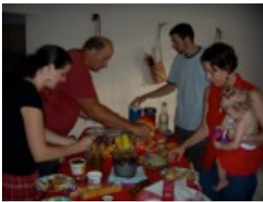
Our team digging in to the snacks on Christmas Eve.