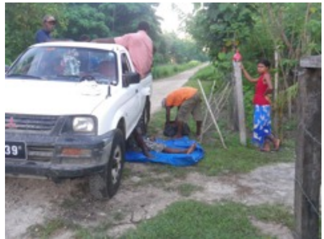
On the way to the airport, the lady in the red shirt accidentally poured unleaded instead of diesel, so we had to empty the tank and try again