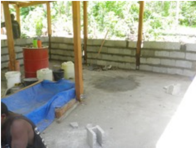
Completion of the block work

We are planning to start our first official Malekula rotation on January 27, at which time we will be sending our final shipment - all our “stuff.” Please be praying that 2011 will prove to be a fruitful year, especially in light of our new focus on this outer island.