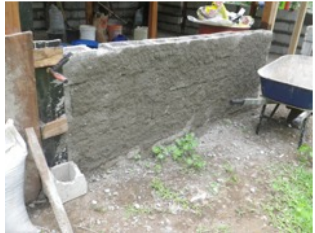
First coat of rendering