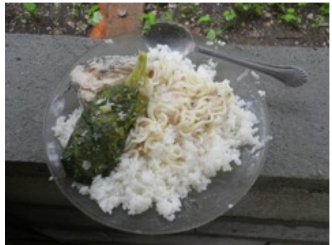
Lunch is served: Fish (bone-in!), simboro (laplap in island cabbage), rice and noodles