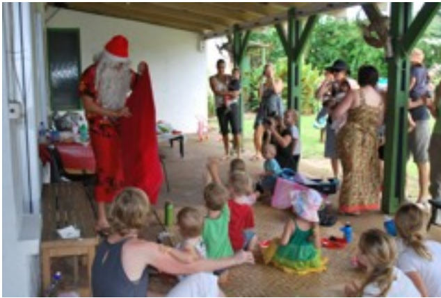
A very-Vanuatu Santa visits playgroup