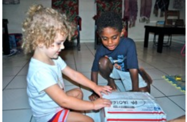
"Can we open it, can we open it!?" Christmas presents are a month-long affair when they come via the postman