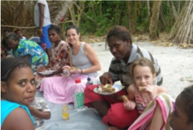
Women from Vila, Etas, Eton and Epau all gather at Eton beach for their annual Christmas lunch and gift exchange