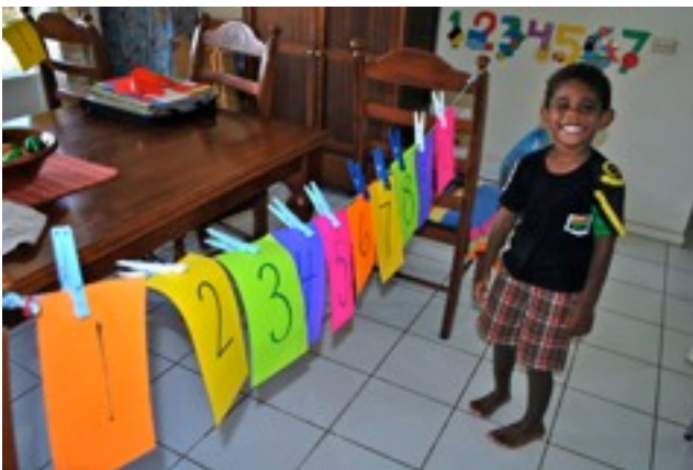
Titus proudly displaying his knowledge of numbers 1 through 10