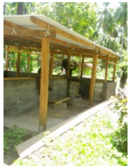
The back porch, which is where we will hang our laundry to dry