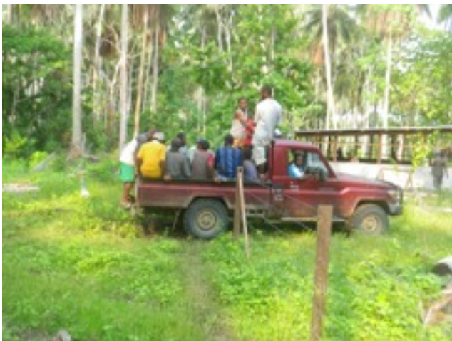
All 14 of these people stopped by and had to take a look at the white man's house! Ahh, the life of a celebrity.