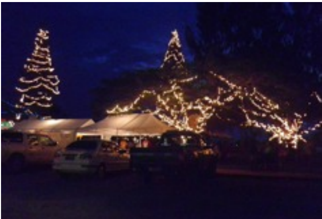
Christmas lights in the park - probably the only such display in the whole country