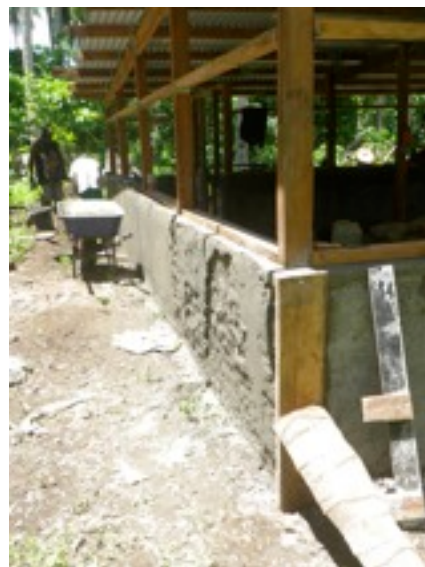
Rendering in progress