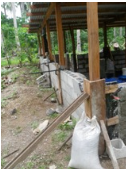
Pouring cement around the posts