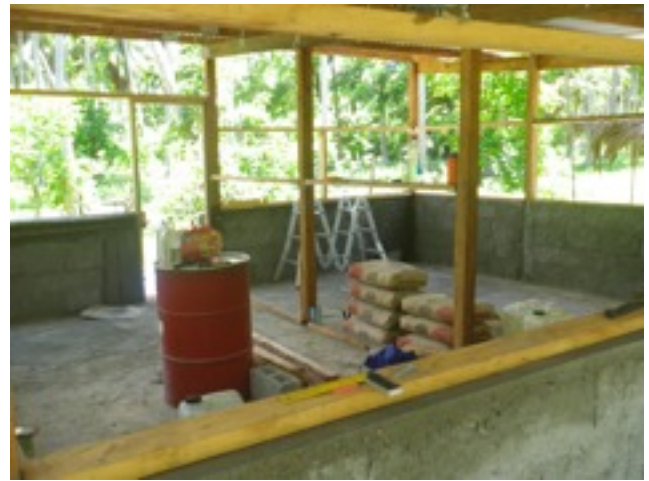
View of the inside, which will be divided into two rooms by a bamboo wall