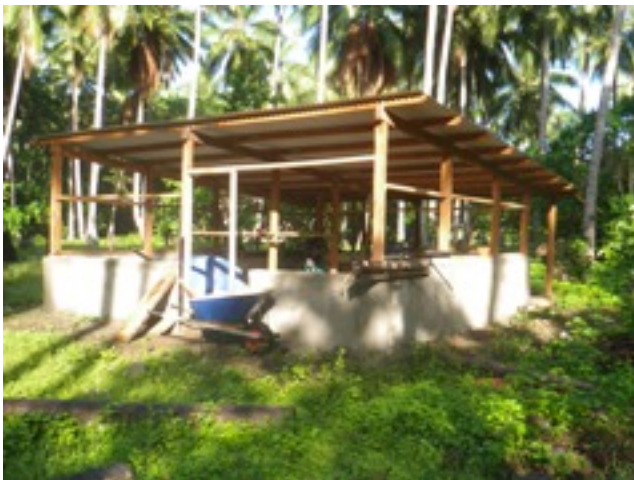
View of the front of the house