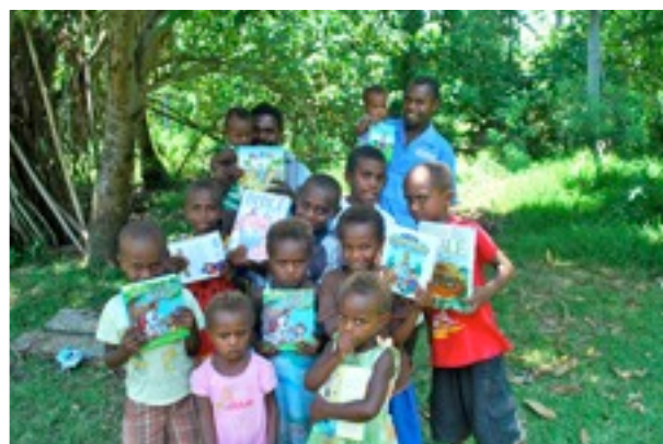
“Merry Christmas” to the kids in Tulwei Village, and “Thank you very much” to the Cherry Vista congregation in Denver, CO.