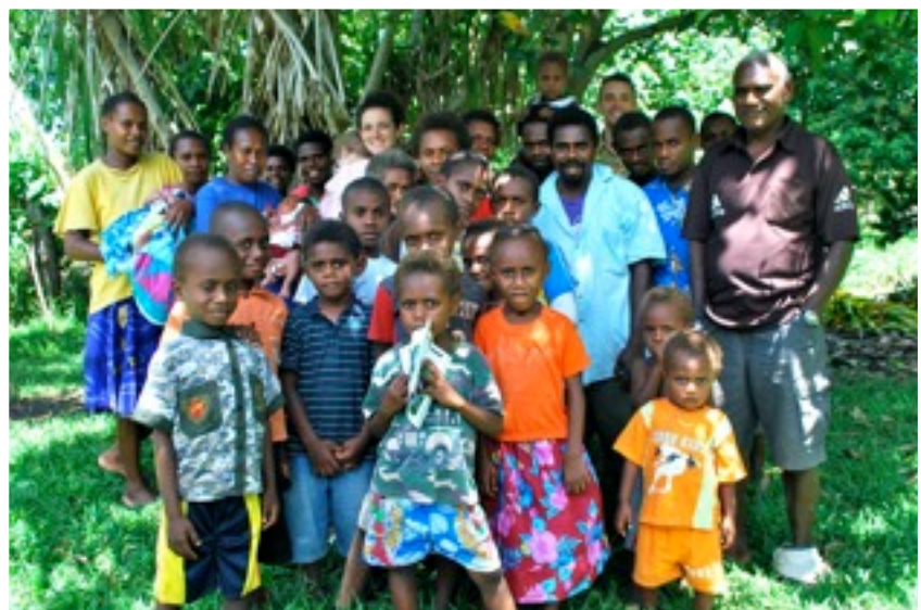
The church that meets in Tulwei Village