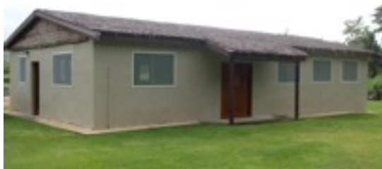
Main building just after the installation of security screens.

We are grateful to report that the building project in Vila is very near to completion.