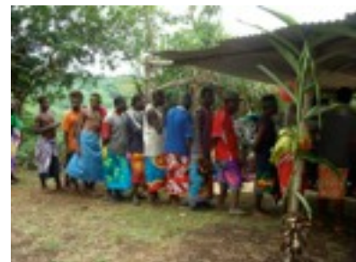
Waiting in line for the food.