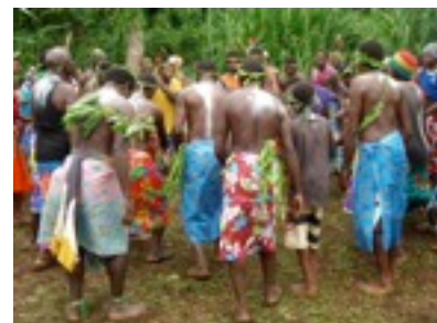
Custom dancing to welcome the bride and groom.