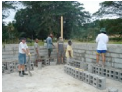
Building up the walls with 20cm concrete blocks