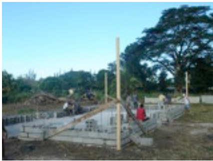
End of workday one

came over from New Zealand to help with this project. Work on Phase 2 started on July 3 and went through the 22. Our team and the brethren here in Vila will continue working until the project is complete. We are all quickly becoming masons, plumbers, electricians, carpenters and roofers (of course, making a few mistakes along the way). We will include more in our next issue.