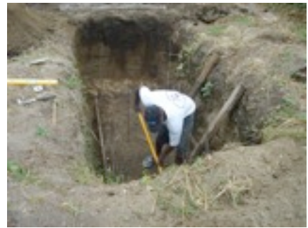
Shem digging a hole for the septic tank