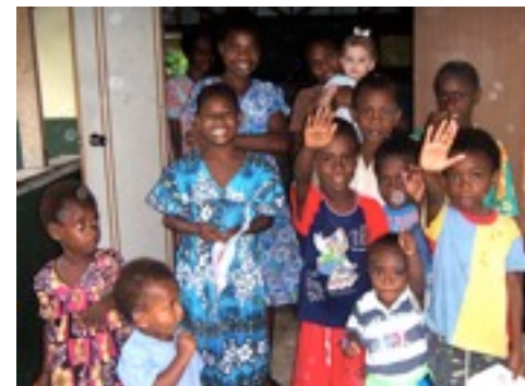
Children coming from Bible class, which was restarted in Epau only a couple of months ago