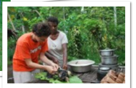
Receiving payment, pouring concrete, and plucking a chicken - all in a day's work!