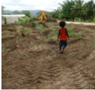
Following the tracks of the digger

averaging 8-10 local Christians and 2-4 visitors. We have a good group of “core” members who are growing in their faith. We were also encouraged by a few Christians who rededicated themselves to the church this month.