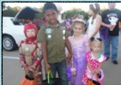
HAPPY HALLOWEEN: Our kids loved their first trick-or-treat experiences, with the added bonus of enjoying it (twice!) with their cousins. Candy!!!