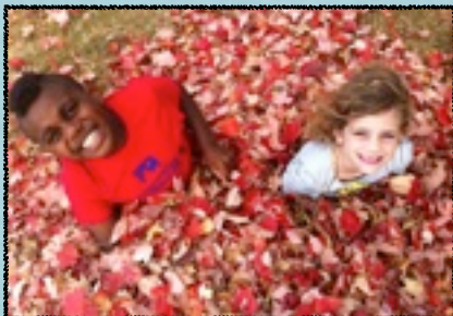
HAPPY FALL: Our family has thoroughly enjoyed the cool temperatures that we aren't used to getting in Vanuatu, and the kids continue to have fun outside.

Our e-Scrapbook editions will be brief while we are in the States, but you can keep tabs on us at our blog: www.missionvanuatu.blogspot.com .