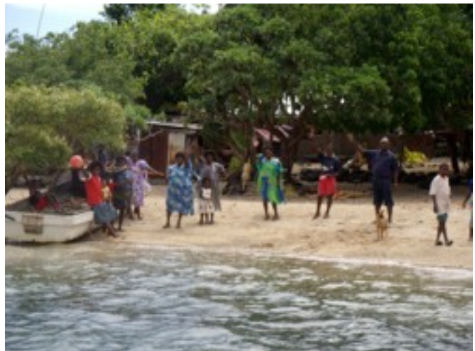
Saying good-bye as our boat departs for the mainland