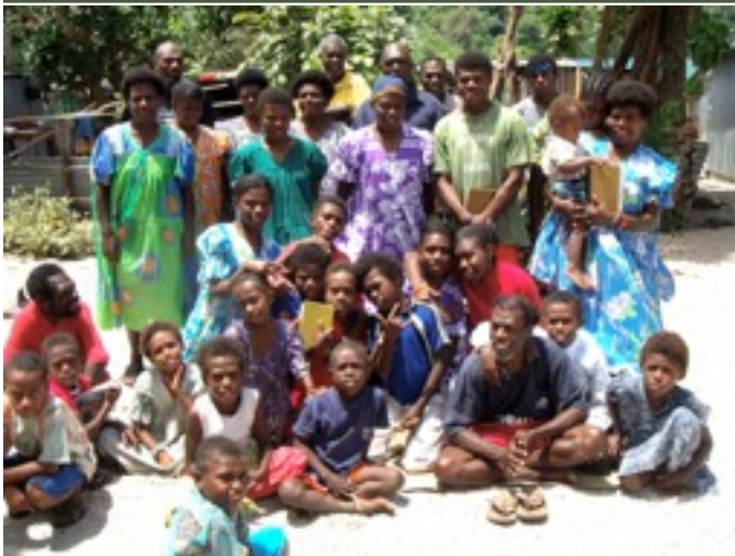
Christians, visitors and children who recently gathered for a Sunday morning worship service in Marou Village

rejoined the predominate denomination in the village, and some had stopped worshiping God altogether (they knew that denominationalism wasn't the answer, but weren't sure where else to turn). They had once again become like "sheep without a shepherd."