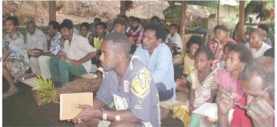
Friends, family and the community turned out for the opening of the Neihala church of Christ on Ambae

In the past there was only one congregation of the Lord's church in the last village of Duviara, located near the top of the mountain in Ambae. To arrive on time for worship, many people who lived down the hill would walk every week one to one and a half hours uphill to arrive on time. Having gone to Ambae and stayed for a few weeks, I witnessed first hand how dedicated some of the Christians were to do this every week! Especially, if it rains walking can be quite a chore!