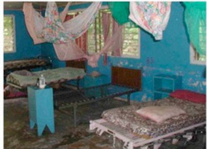
Above: The hospital rooms in Lolowai are anything but "private."