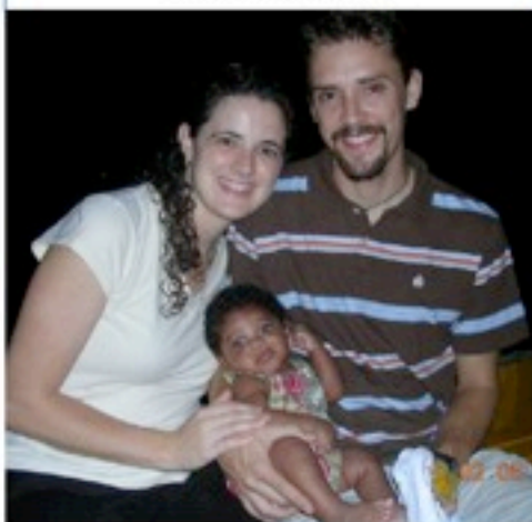
Brandells spending some quality time together.