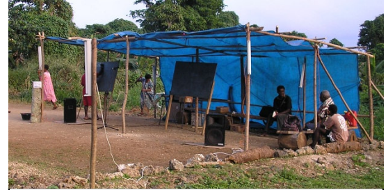
Above: The tarp provided shelter for the week-long Good News Meeting in Etas Village.

From April 8th through April 15th (Sunday to Sunday) we held a meeting each evening from about 6—9pm. Lessons were presented and time was allowed for a question and answer session. Many people asked genuine questions wanting to know about salvation, baptism, miracles, drinking problems, etc. Truly the culture here in Vanuatu is such