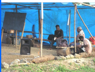
Below: Good News Meeting setup included generators, tarps, sound system and blackboard