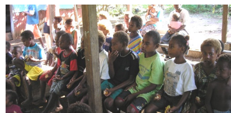
Above: Last day of school is always the best! As a treat, the kids squeeze in tight to watch the movie Aladdin .