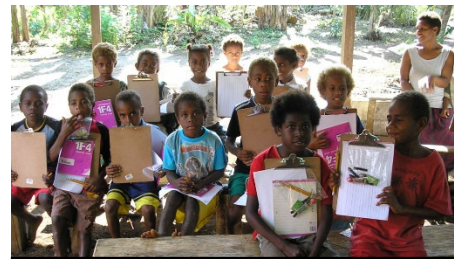
Above: First year students holding up their clipboards and workbooks as they prepare for class. Clipboards and pencils were donated by the Christiansburg church of Christ in Virginia and were very beneficial to the students.

It was another great year teaching the kids that I love. They are all so special to me and I'm thankful for the time that I was able to spend teaching them!