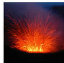
Home to active volcanoes, Tanna is a fascinating place to visit. This trip, we'll be taking the Gospel to Tanna.

Pray for this trip as it is a 'groundbreaking' trip to sew the seed of God's Word. We pray that the seed may fall on soft hearts, willing to grow and produce for the Lord.