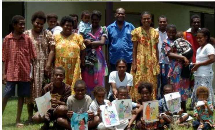
Right: Due to building progress, Christians are now able to gather and enjoy a place where they can fellowship together.