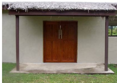
Left: The building in Vila now has paint and doors! A huge step towards completion.

Claude and Flexon were back in Vila for the month of October, and picked up where they left off regarding their leadership roles. These two men and their families are so very important to the current and future success of the Vila congregation. The church is blessed to have them as leaders, and our team looks forward to edifying and equipping them for service.