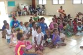
Above: The kids listen intently to the lesson and are captivated by the puppet skit. This is the first time they have ever seen puppets! Average attendance each month is around 40 kids! What a great program!