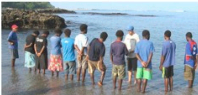
Above: 8 people get ready to put on Christ in baptism in the exact location where over 100 years ago the first missionaries came ashore on Tanna island.